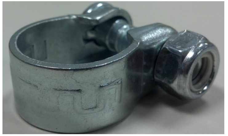
Insert the bolt into the clamp. Line up the notch on the bolt with the keyway on the clamp.