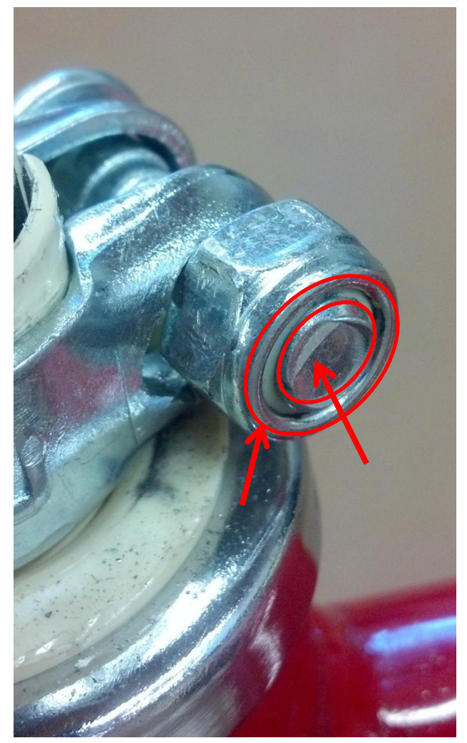
Tighten the bolt until the outer face of the nut and end of the bolt are aligned.