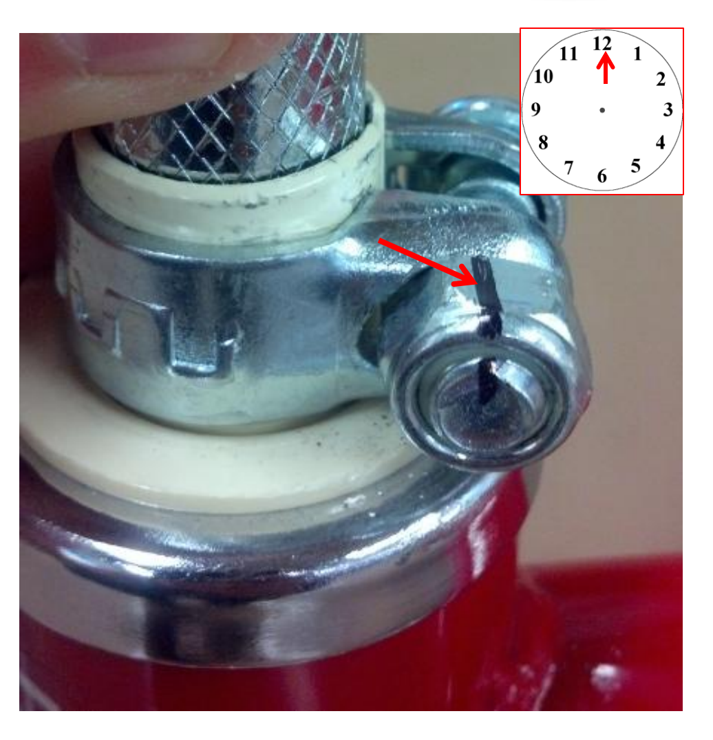
With the nut and bolt surfaces in alignment, draw a line on the top surface of the nut at the 12 o'clock position.